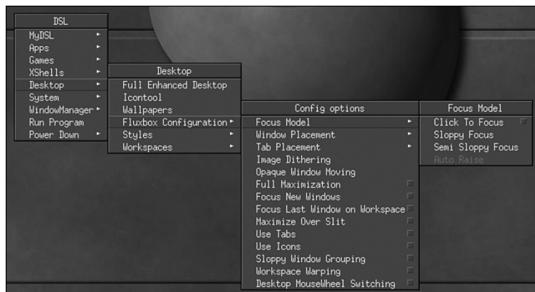
FIGURE 1-2 Customize your desktop settings from the DSL menu.