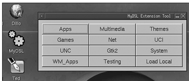
FIGURE 1-3 Customize your desktop settings from the DSL menu.

Chapter 5 includes descriptions of the MyDSL facility. Descriptions of MyDSL center on the MyDSL Extension tool, shown in Figure 1-3.